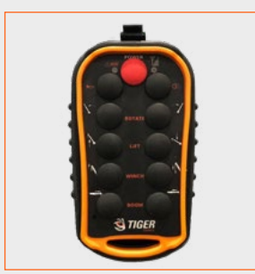
Standard wireless remote provides additional functionality and freedom of operator movement.