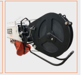
Hydraulic and manual boom extension with standard A2B.