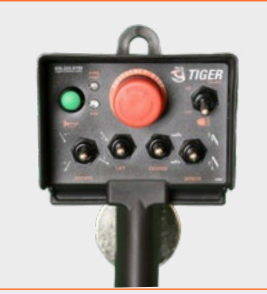
Optional remote with 25' tethered cord (no wireless functionality).