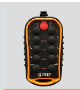
Standard wireless remote provides additional functionality and freedom of operator movement.