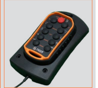
Optional wireless charging pad.